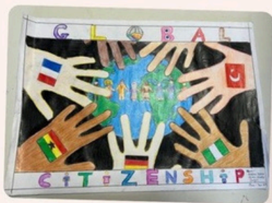
Tuesday - posters on Global Citizenship