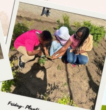
Friday- Planting in the school garden