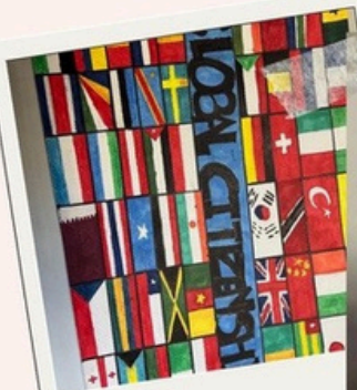
Thursday- Artworks by students